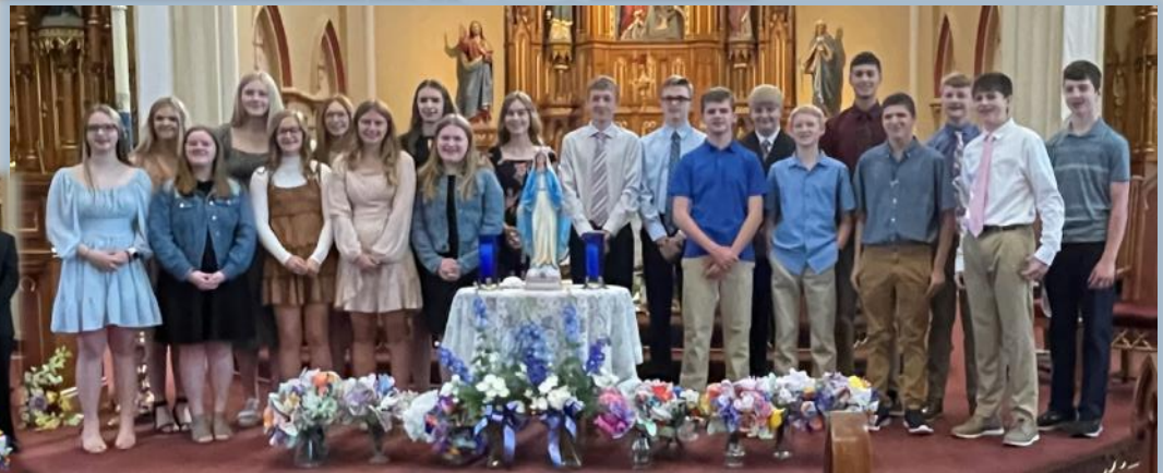
Throughout history, Catholics have long honored the Blessed Virgin Mary during the month of May. To symbolize her significance in the Church and in our lives, the "May Crowning" is set up to display her queenship as the mother of Jesus.