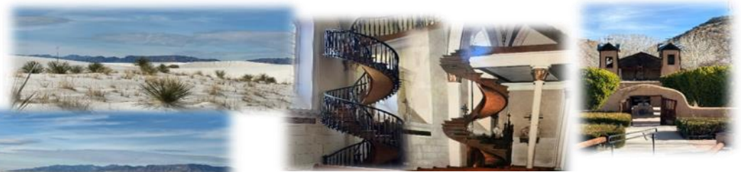
White Sands National Park, The Miraculous Staircase, & El Santuario de Chimayó (Shrine with Holy Soil)